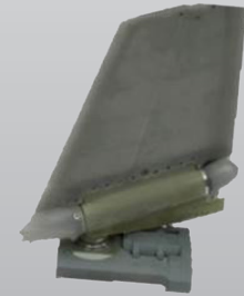
Tomahawk Cruise Missile Actuator and Fin