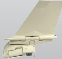
Harpoon Missile / SLAM-ER Cruise Missile Actuator and Fin